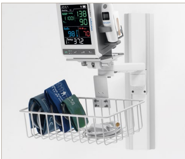
Wall mount with basket

The SC300’s flexibility is enhanced through a choice of mounting options, users can select either a mobile stand with integrated accessory storage, a wall mount option also with a storage capability or an IV pole attachment where space may be limited.