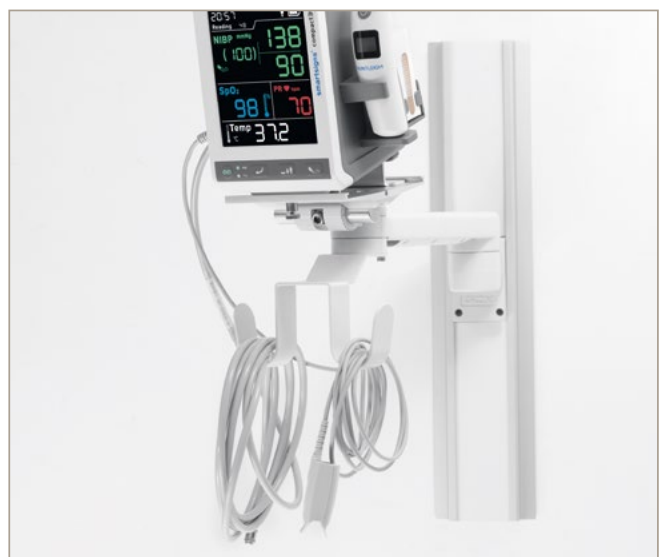
Wall mount with utility hook