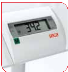
The patient's BMI can be determined when his height is entered.

Experts predict that, by the year 2040, half of the world population will have a BMI of over 30 kg/m which means obesity. Here the seca 635 with its integrated BMI function helps to evaluate the nutritional condition and makes early action possible.